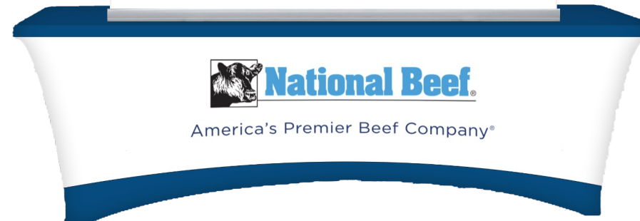
6' and 8' Stretch Fabric Table Cover + Navy Vinyl Topper