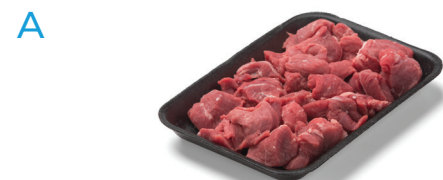
Cube Steak / Stew Meat

See next page to continue processing the sirloin (C).