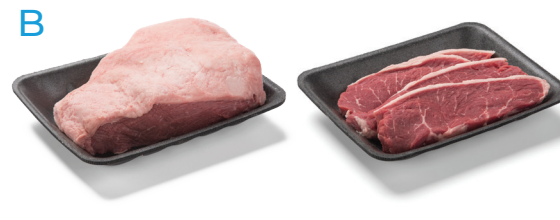
Coulotte Roast / Coulotte Steaks