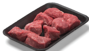
Stew Meat / Kabobs

Cut and trim steaks up to 1" thick down the entire piece. Tray whole for top sirloin steaks or cut in half and tray for baseball steaks .