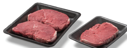
Top Sirloin Steaks